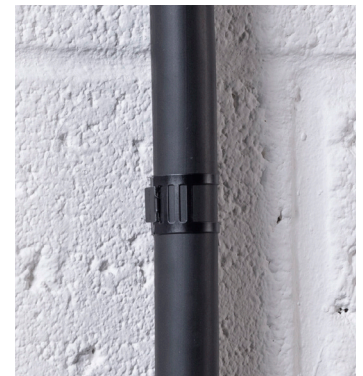
Provides a 0.12" stand off from the surface