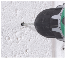
Drill a 3/16" (0.2") pilot hole