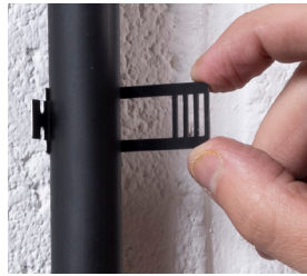
Simply wrap around the cable