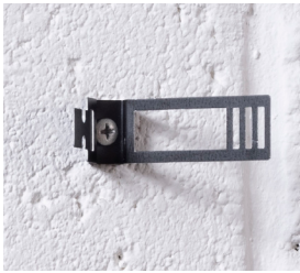
Secure screw-fix, no wall plug required