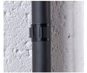
Tight fitment, neat appearance

These Cable Fixing Packs are ideal for EV charging cables. Each pack contains 20x fire-rated screws for masonry, concrete & brickwork; with no wall-plug required.