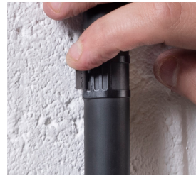
Secure cable with locking tab