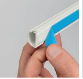
Self-Adhesive for peel & stick. (then can be drilled) Plain back & removable tape options also.