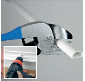
Lightweight & easy to cut (Can be drilled and screw fixed)