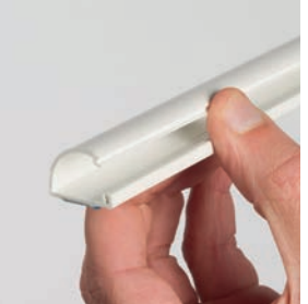
Patented hinge & click-lock lid for one-piece installation