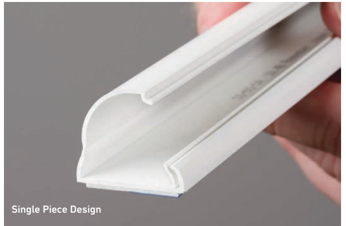
Single Piece Design

D-Line 40 x 20mm Mini+ profile provides capacity ideal for 2x 4mm T&E cables for example.