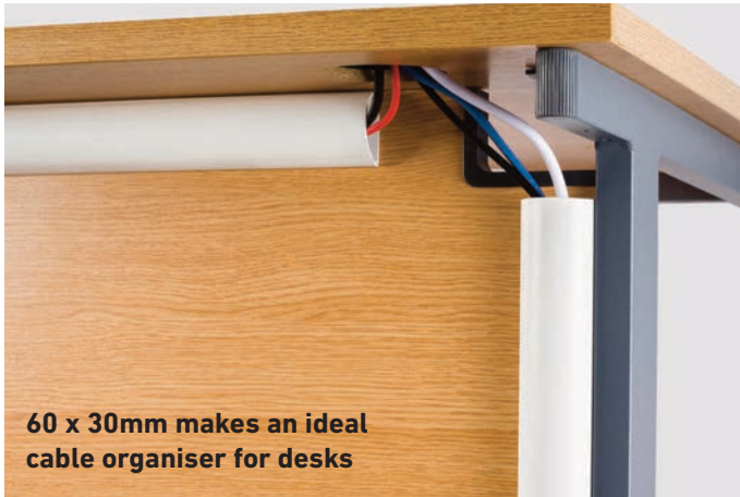
60 x 30mm makes an ideal cable organiser for desks